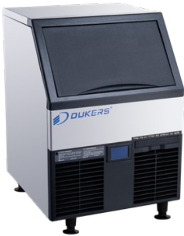
—DIM-150 / 300—